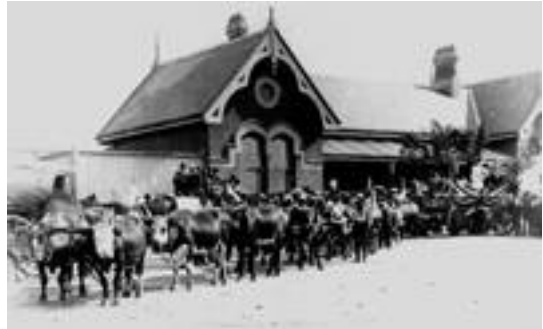
Bairnsdale Railway station 1890's

Next Issue : Murder mystery at Bairnsdale.