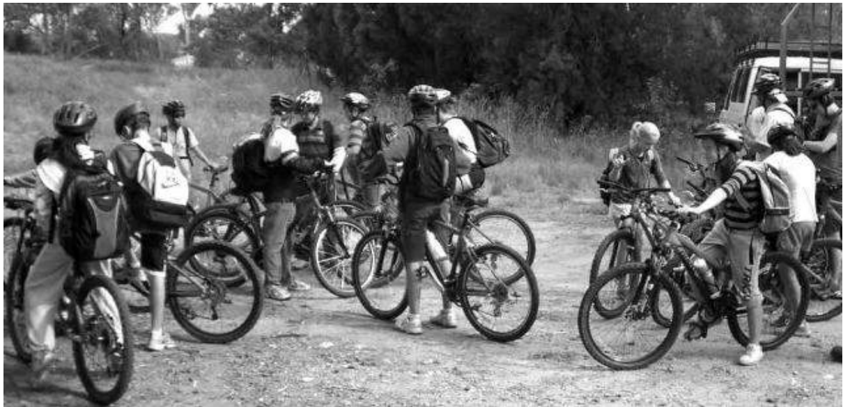
School group from Carey Grammar in Melbourne joining the trail at Bumberrah to ride back to Bairnsdale

It was perhaps a bit ambitious at the time, but when preparing the new (third edition) information and map brochure (with a print run of 40,000 copies!) it was decided to cross reference the map to a set of trail notes to be available as PDF files on the web site. Michael has been drafting the Notes and recently had an offer from the father of a visiting cyclist to help by typing up the rough notes. Brian lives in Kyabram but thanks to email can send Michael the typed up files, speeding up the process of getting the Notes into production. The plan is that the files can be easily updated as new material becomes available.