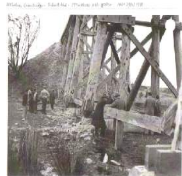
Officials looking at the damage

At that time the trestles on the Noojee line were burned down during a bushfire by sawmill mobs with their own trucks, to starve the railways of the traffic and give them the monopoly. The Nayook-Noojee section closed in 1954 and given that this incident is in that same era and that 412% of the traffic between Orbost and Bairnsdale was timber, the conclusion may well be that the bridge could have been sabotaged by the local sawmillers!! Next Issue :Memories of Bairnsdale